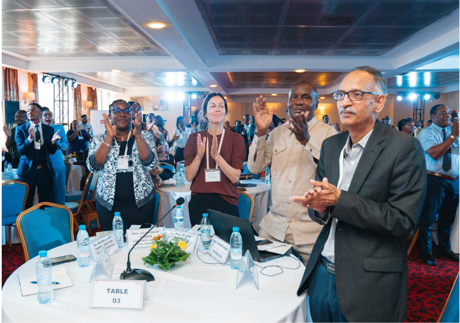
© DLFF / 2025 Central Africa Think Tank Forum