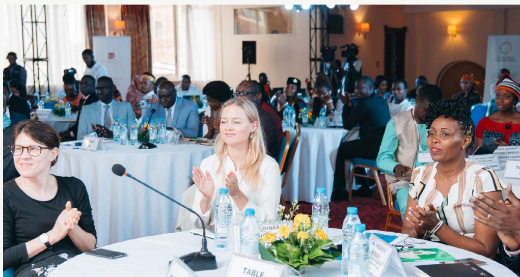
© DLFF / 2025 Central Africa Think Tank Forum

The Nkafu Policy Institute seeks strategic partnerships and sponsorships from regional governments, international organizations, and private sector entities to support the successful organization of the 2025 Central Africa Think Tank Forum. These partnerships will be crucial for ensuring the impact and reach of the event.