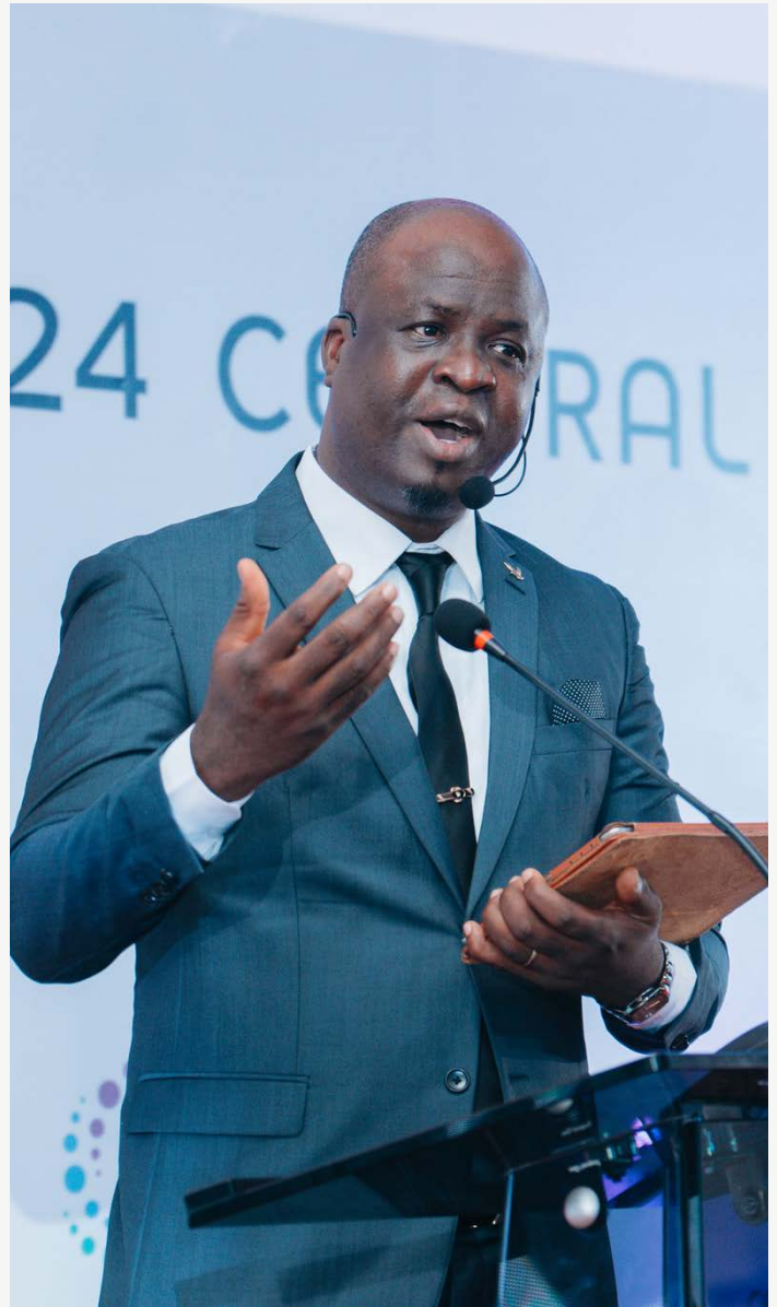
© DLFF / 2025 Central Africa Think Tank Forum